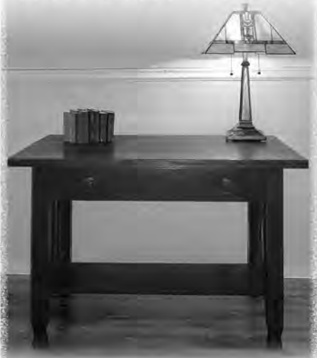
Stickley Brothers Library Table Original finish & hardware

3169 Morgan Ford Road, St. Louis, Missouri 63116 • (314) 776-7898