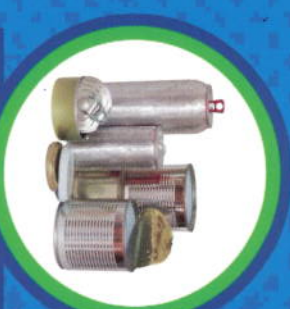
Metal Food & Beverage Cans