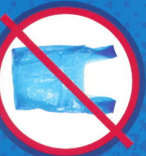
Plastic Bags & Film