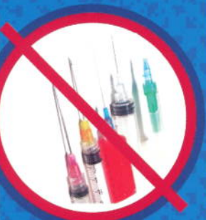
Sharps & Needles